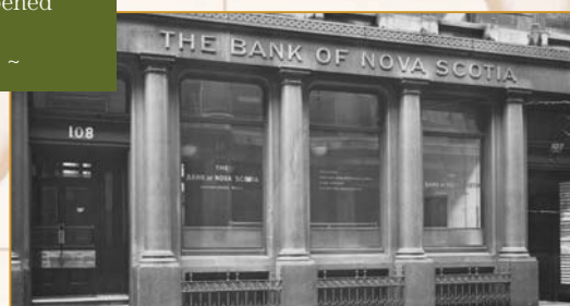
On 03 August 1920, Scotiabank opened its first European branch in London, England. ~ London branch, 1930s ~