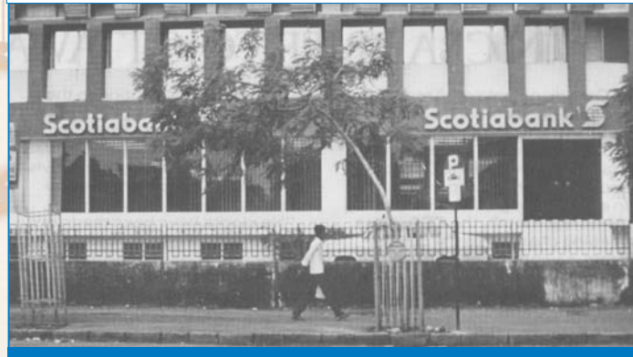
On 02 September 1982, Scotiabank opened a representative office in Bombay, now called Mumbai. ~ Mumbai (Bombay) branch, May 1984 ~