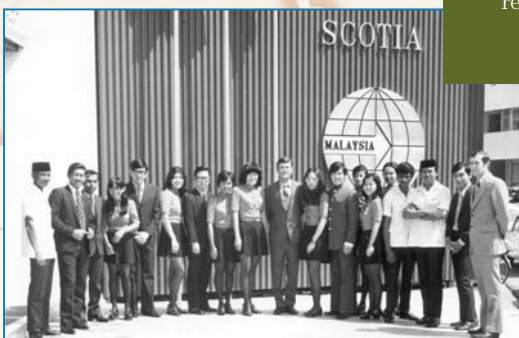
Scotiabank opened its first branch in Malaysia in Kuala Lumpur on 26 March 1973. Staff of the ~ Kuala Lumpur branch, 1973 ~