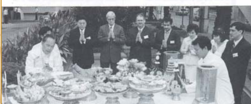
With the opening of a representative office in Bangkok on 01 September 1980, Scotiabank has maintained a presence for over 25 years in Thailand. ~ Opening ceremonies of Bangkok branch, 02 July 1998 ~