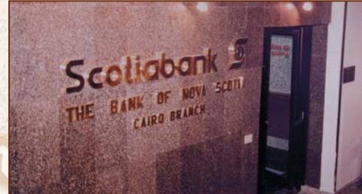
Scotiabank's first branch in the Middle East was opened on 08 November 1965 in Beirut. ~ Cairo branch, 1990s ~