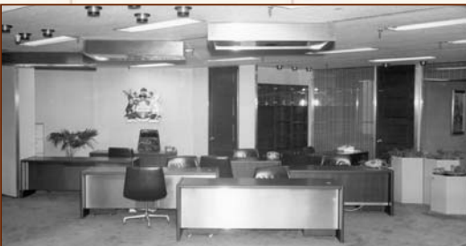
Scotiabank was the first Canadian bank to open a branch in Korea on 06 March 1978. ~ Seoul branch, July 1978 ~