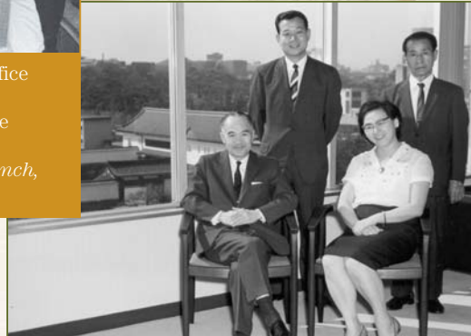
Scotiabank's first branch/office in Asia was a representative office in Tokyo that opened on 25 July 1962. ~ Tokyo office staff, c. 1962-1964 ~