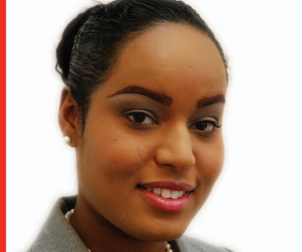
Tayamadai Ao Banking Certificate