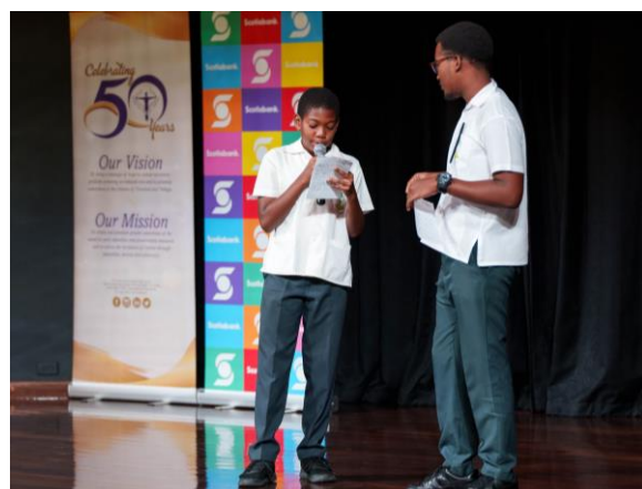
These youth present what they learnt at the Symposium held for Schools in North Trinidad at the Central Bank Auditorium.